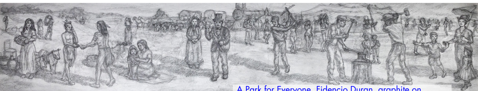
A Park for Everyone, Fidencio Duran, graphite on paper, 2015, Mexic-Arte Museum Permanent Collection