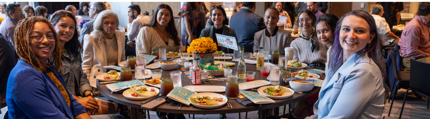
Downtown Austin Alliance Staff at Cinco de Mayo Luncheon 2024