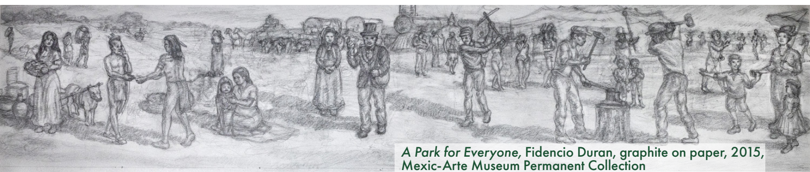
A Park for Everyone, Fidencio Duran, graphite on paper, 2015, Mexic-Arte Museum Permanent Collection

Fidencio Duran's A Park for Everyone , pictured below, is a sample of both the Museum's expansive permanent collection and an imagining of Republic Square in the late 19th Century.