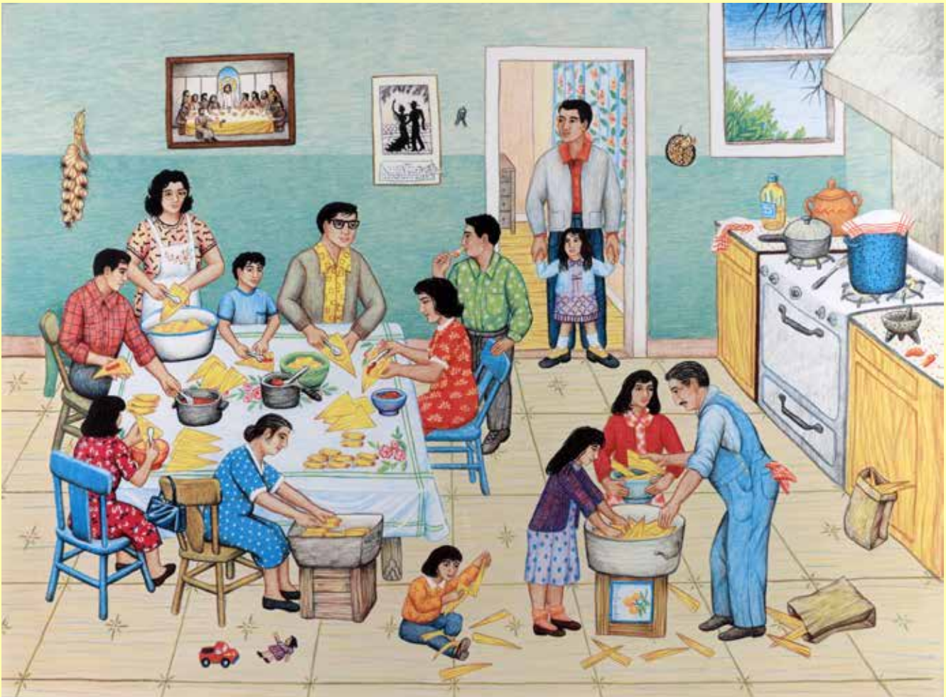
Carmen Lomas Garza Tamalada , 1990 Color lithograph on paper

Artist Carmen Lomas Garza was born in Kingsville, Texas, located near the Mexico – United States border by the Gulf of Mexico. She created a series of works that recall memories of her life growing up with her family in the small border town. In a tamalada , families gather to make large batches of tamales during the holiday season. The entire family, adults and children alike, organize an assembly line to produce tamales . Garza uses these scenes of family life to educate mainstream America about the traditions that are passed on from one generation to the next.