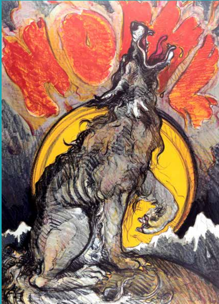
Luis Jiménez Howl , 1977 Lithograph on paper

Look closely at this print by artist Luis Jiménez. Luis Jiménez was born in the far West Texas city of El Paso, located in the Chihuahuan Desert, which is the largest desert in North America. It is the most biologically diverse desert in the world, and is home to over 130 species of mammals, including the Mexican grey wolf, which is depicted in this print. Wolves communicate with their pack by howling; they do this to express their location, mark their territory or as a warning.