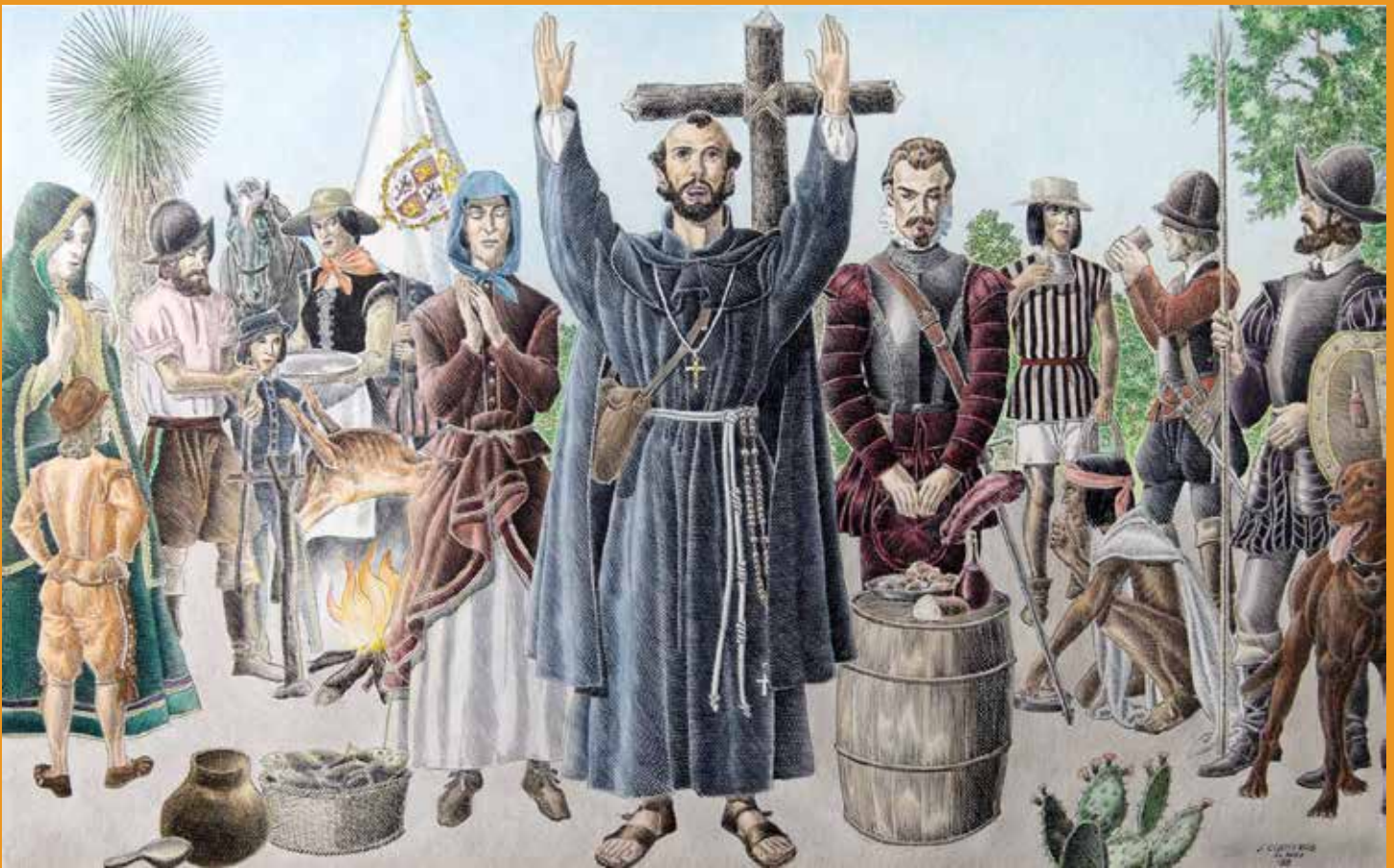
Luis Jiménez The First Thanksgiving , 1989 pen, ink, and color pencil

Historical artist José Cisneros produced many illustrations depicting the “First Thanksgiving” in the United States. This historical event, which pre-dates the Jamestown pilgrims, relates to the entry of Don Juan de Oñate into El Paso del Norte (modern day Ciudad Juárez, MX and El Paso, TX). After completing the final stretch of their expedition through the harsh Chihuahuan desert, it is believed that here, the colonizers, and the Manso people, gave thanks after the long journey. Artwork can be used to capture a moment in history, or the story of a person, community, or country.